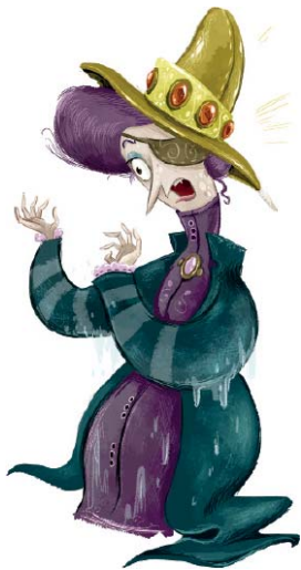
5. The Wicked Witch of the West