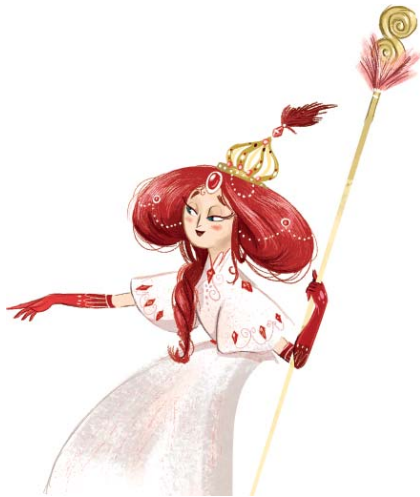
3. The Good Witch of the South