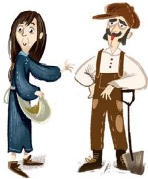
2. Aunt Em and Uncle Henry