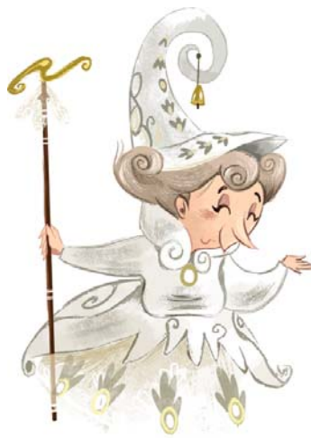
6. The Good Witch of the North