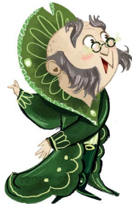
4. The Wizard of Oz