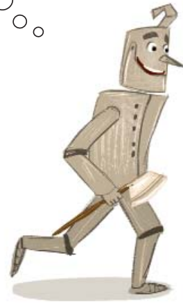
The tin man