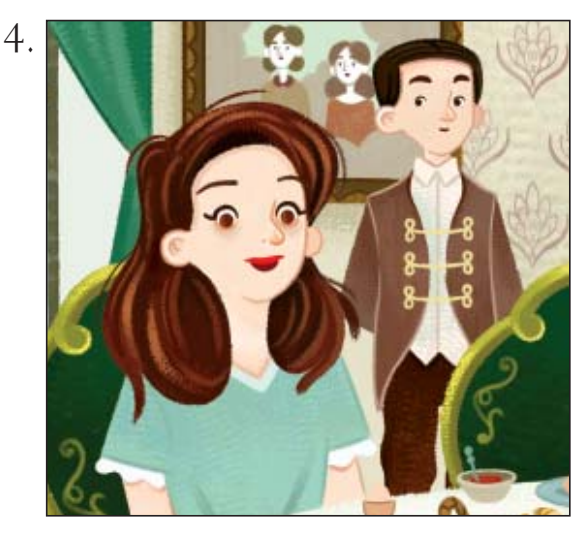
"I'm ...... I can't sleep."